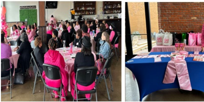
In October over 60 women attended this Breast Cancer Lunch and Learn